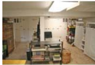
08 Rec Room