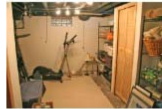
09 Exercise Room