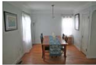
03 Dining Room