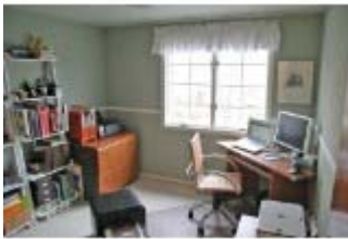
07 Bedroom Office