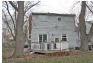
01 Welcome to Columbia

The accuracy of all information, regardless of source, is not guaranteed or warranted. All information should be independently verified.