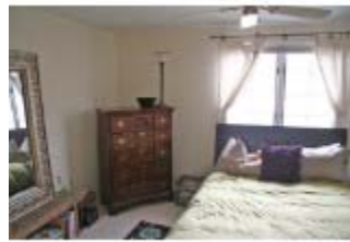
05 Master Bedroom