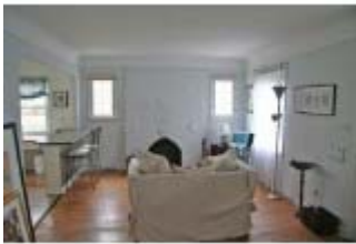
02 Living Room

PublicRemarks: Charming Berkley two story with 2 full baths. The updated kitchen features white cabinetry and a hardwood look Pergo flooring. There is snack bar with granite top between the LR and the kitchen. All kitchen appliances are included. Anderson door wall leads from the kitchen to the rear decking. A great home.